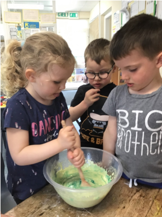
Communication and Language