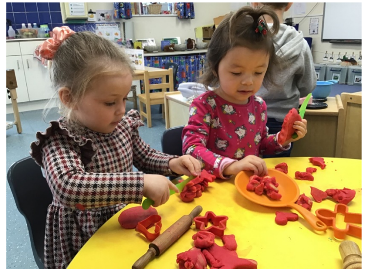
Personal, Social and Emotional Development